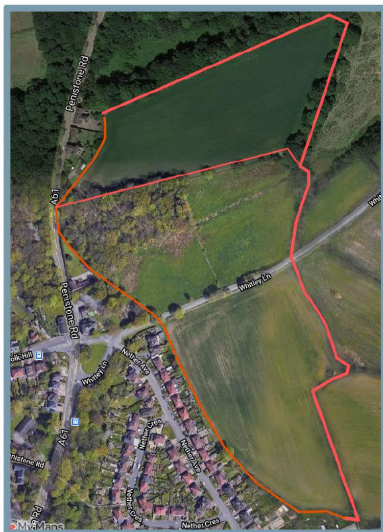
Figure 1 : Site Location Plan

8.1 The whole site extends to approximately 7 hectares and is currently in agricultural use. The site comprises two interrelated parcels of land (parcel 1 - 4.4ha and Parcel 2- 2.6 and are currently in agricultural use. The site lends itself to a development of mixed family market housing with a percentage of affordable houses. We have estimated through the initial masterplanning work that the capacity of the site would around 200 units. Below is a site location plan and Appendix 1 of these representation provides a concept landscape framework showing how the site could be developed: